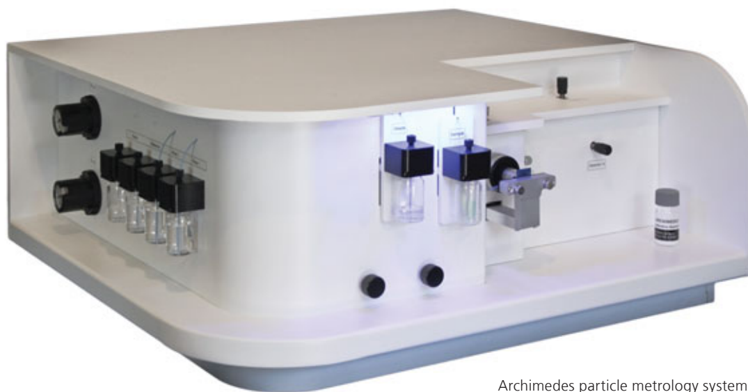
Archimedes particle metrology system

Archimedes is also uniquely able to differentiate between negatively buoyant and positively buoyant particles, enabling the discrimination of such particles as protein aggregates and droplets of silicone oil, regular contaminants of biopharmaceutical final formulations stored in prefilled syringes.